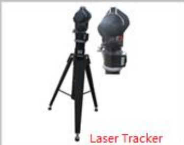
Laser Tracker T3激光跟踪仪