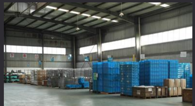
Finished product warehouse