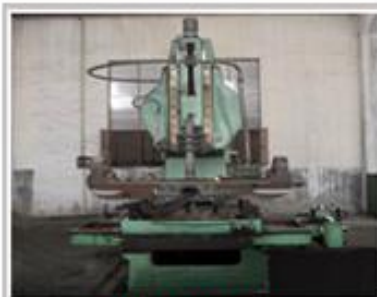
slotting machine 插床