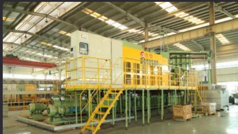
2500T die casting machine