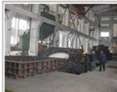
Modeling scene 造型现场