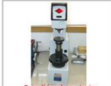
Brinell hardness tester HB-3000布氏硬度计