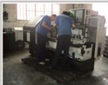
CNC Lathe 数控元车]