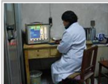
Carbon silicon thermal analyzer 碳硅热分析仪