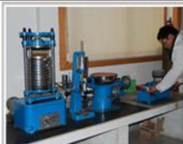
sand testing 型砂检测