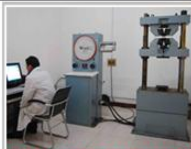
Hydraulic universal testing machine 液压式万能试验机