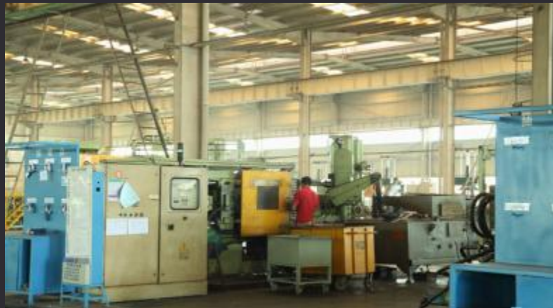
280T die casting machine