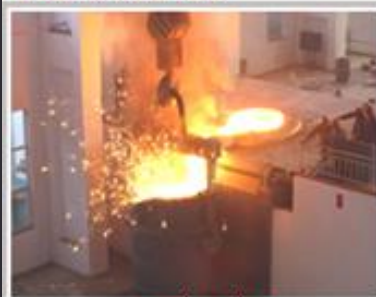
Casting site q7