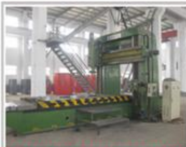
BXM gantry type milling machine BXM龙门铣床