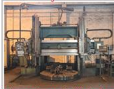
heavy duty vertical lathe from Russia 俄罗斯重型 Φ2.5m立车