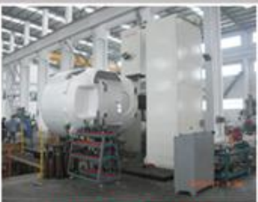
Large horizontal CNC 大型卧式加工中心2