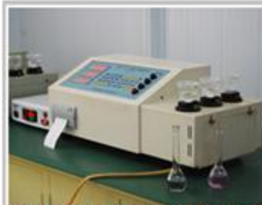
High speed analyzer of Si-Mn-P 三元素 (Si-Mn-P) 高速分析仪