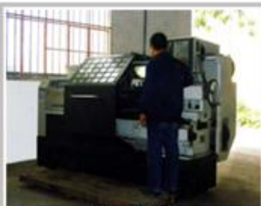
CNC Lathe 数控元车[1]