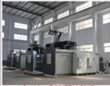
2m*4m GANTRY CNC 2M X 4M五面体龙门加工中心