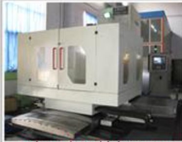
Horizontal machining centers TH61140卧式加工中心