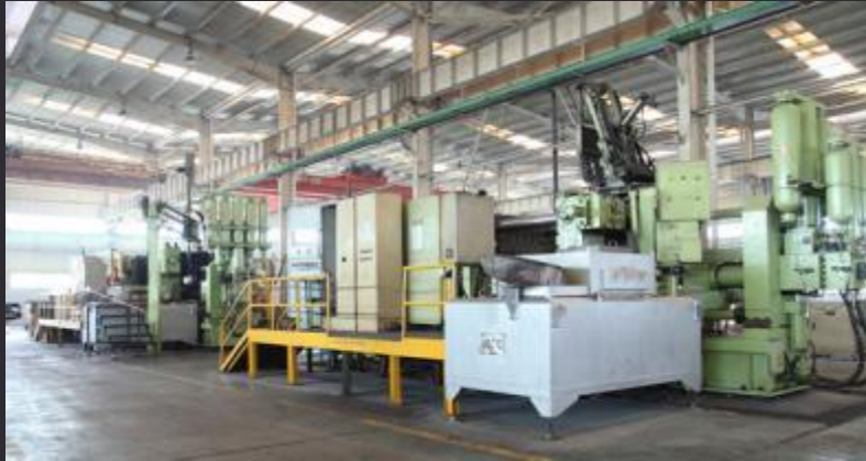
1000t die casting machine