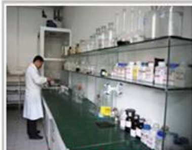
Chemical analysis 化学分析