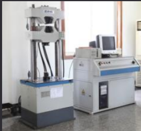
Material tensile testing machine