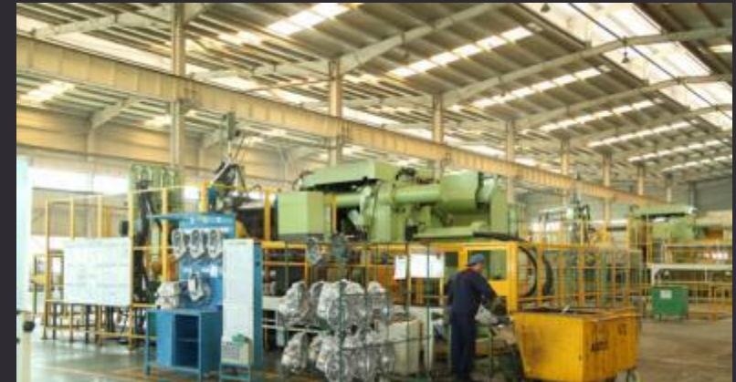
1600T die casting machine 2