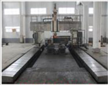
4m*10m GANTRY CNC 4M X 10M五面体龙门加工中心