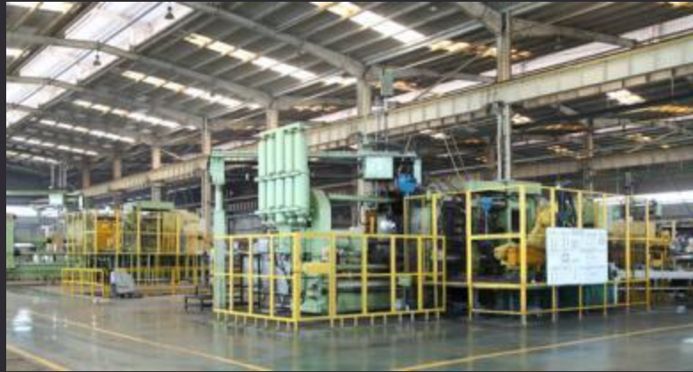
1600T die casting machine 1