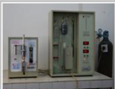
Sulfuric acid microcomputer 硫酸微机自动分析仪 automatic analyzer