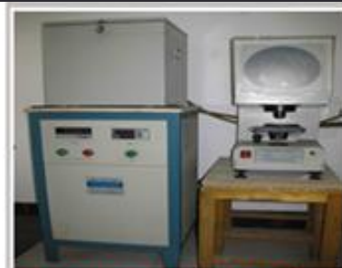
Impact gap projector and 冲击缺口投影仪及低温槽 low temperature tank