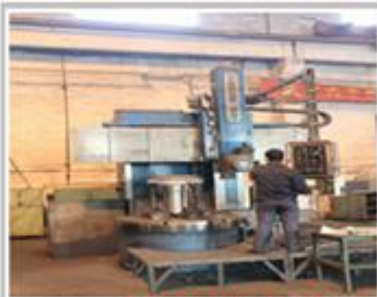
1.6M Vertical Lathe 1.6M立车2