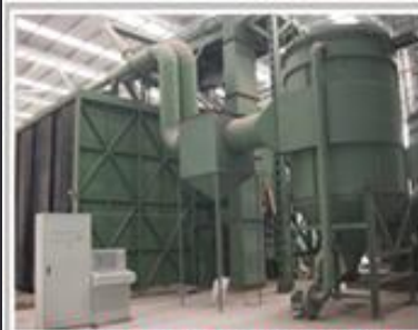
Rotary blast cleaning chamber 转台式抛丸清理室