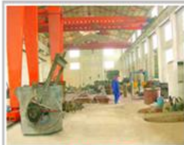
Casting site q6