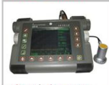
Ultrasonic Flaw Detector USM35XDAC超声波探伤仪