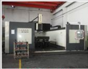
2.5m*6m GANTRY CNC 2.5M X 6M龙门加工中心