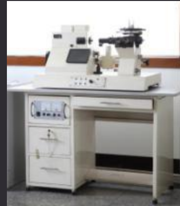
Coordinate measuring 1