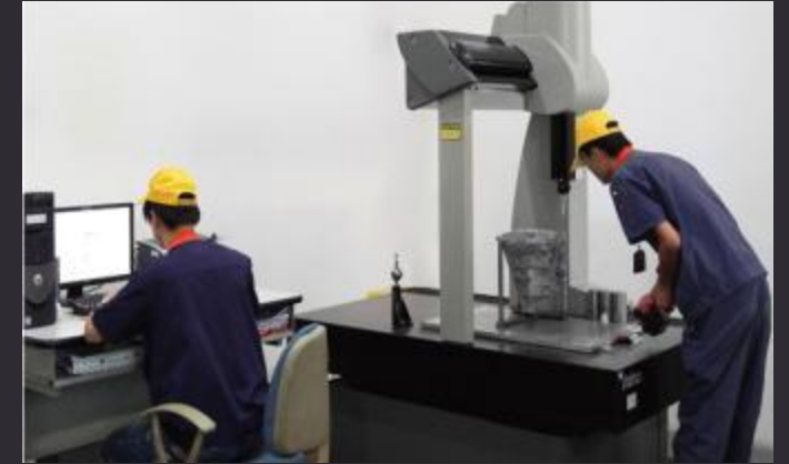
Coordinate measuring 2