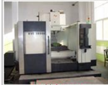
Machining center KVC14000加工中心