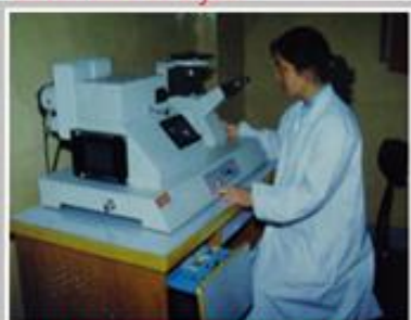
Microscopic examination 炉前金相检测