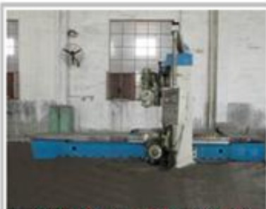
gantry type milling machine 龙门铣床]