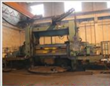
heavy duty vertical lathe from Russia 俄罗斯重型 Φ4m立车