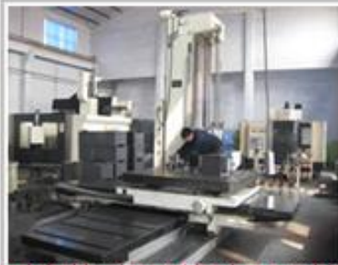
Digital horizontal boring machine FX6045数显卧式镗床