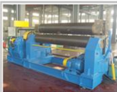
rolling machine 机械卷板机