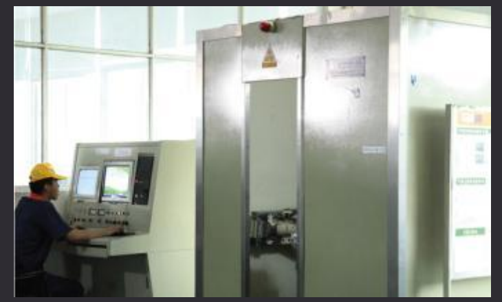
X-ray detection machine