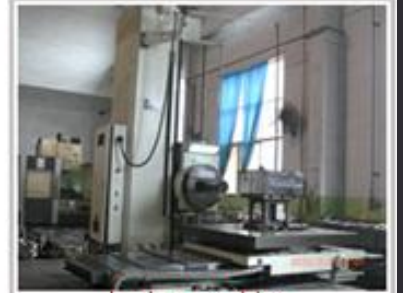
boring machine 130镗床1