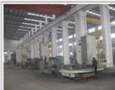
site of workshop 车间一角