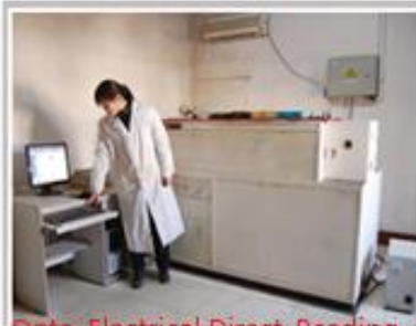
Opto-Electrical Direct-Reading Spectrometer 光电直读光谱仪