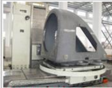
Planer type CNC boring and milling machine TK6516卧式数控镗铣床