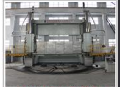
Heavy Duty vertical lathe 重型 Φ6.3m立车