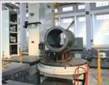
Large horizontal CNC 大型卧式加工中心