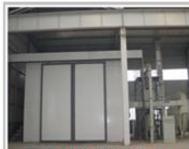
sand-blasting chamber 喷砂室