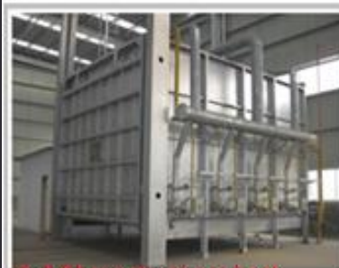
Full fiber natural gas heat 全纤维天然气热处理炉]