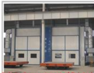
Baking Compartment of Painted Parts 喷漆烤漆房