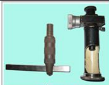
Hardness tester 锤击式布氏硬度检测仪