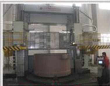
CNC Vertical Lathe CK5240数控立车