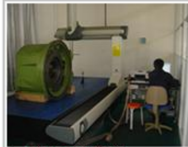
Three coordinate 三坐标尺寸检测仪 (CMM) measuring instrument