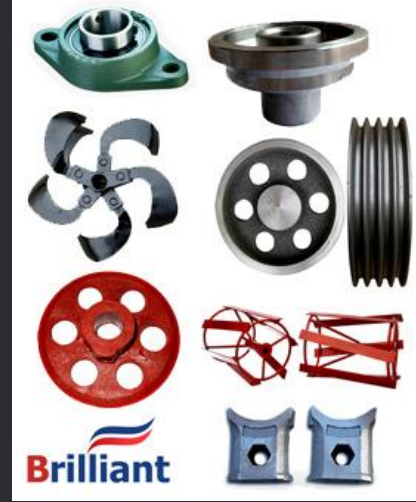
FARM MACHINERY PARTS