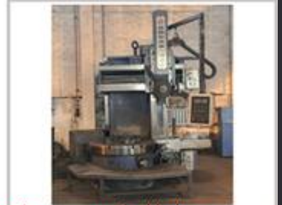
vertical lathe 1.6M立车