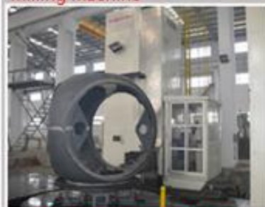
boring and milling CNC TH6920落地镗铣加工中心