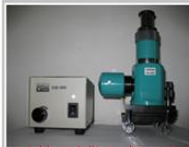
portable metallographic analyzer 便携式本体金相仪