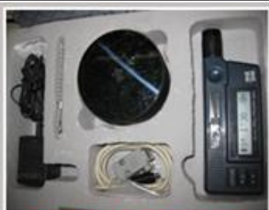
Integrated hardness tester 一体化里氏硬度检测仪