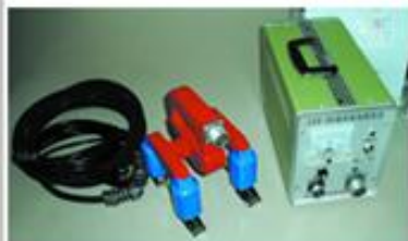
MAGNETIC PARTICLE TESTER 磁粉探伤仪