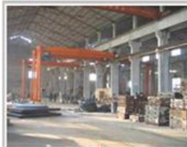
A corner of workshop q5