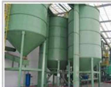
Resin sand reclamation equipment 树脂砂再生设备