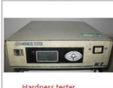
Hardness tester HLS-11D里氏硬度检测仪