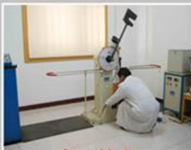
Impact test 冲击检测